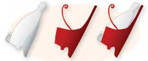
crown of Upper Egypt

The rock shows a figure carrying a staff. Near the head of the figure is a scorpion. Another artifact, a macehead, also shows a king with the scorpion symbol. Both artifacts suggest that Egyptian history may go back to around 3250 B.C. Some scholars believe the Scorpion is the earliest king to begin unification of Egypt, represented by the double crown shown below.